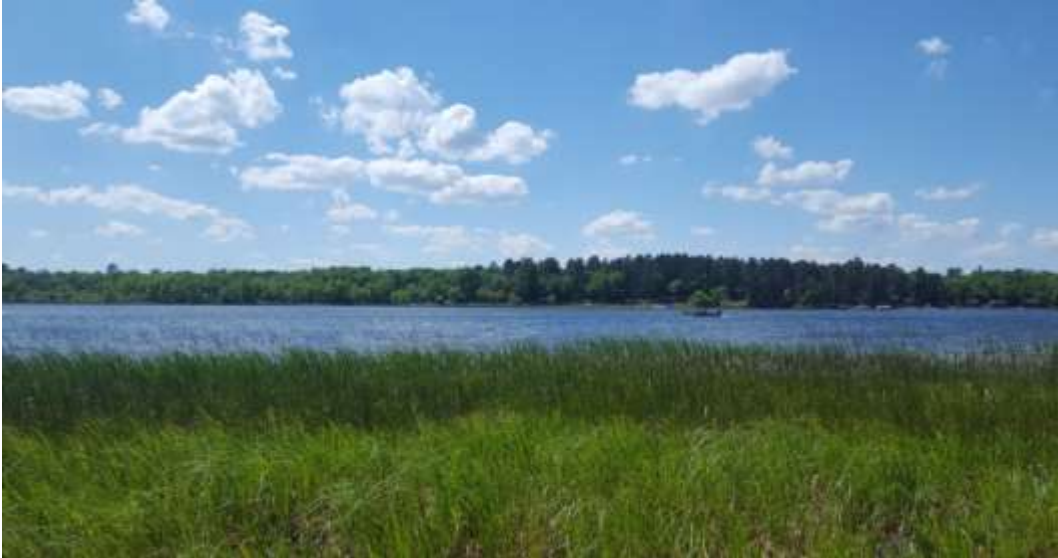
in 2020 on a site visit on Eagle Lake.

This is a healthy wetland buffer shore, which does a lot of work to protect Eagle Lake from sediment and nutrients each time it rains.